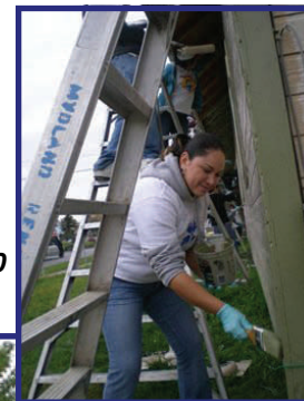
Yakima Valley members participating in the 2010 Make a Difference Day

Yakima Valley Farm Workers Clinic (Toppenish, WA) www.yvfwc.org