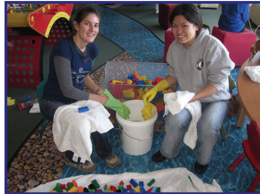
Members teamed up for MLK Day 2011