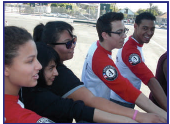
Members volunteer within their community

Community HealthCorps* AmeriCorps members acquire new skills and knowledge that enhance their effectiveness and value to patients and other individuals through pre-service orientation, in-service and advanced trainings.