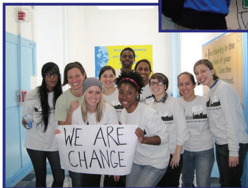
Members from The Institute for Family Health volunteering during MLK Day 2011