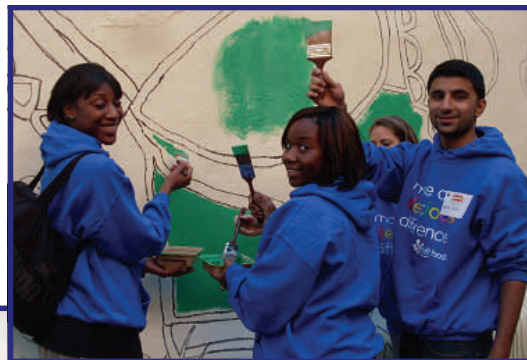
New York VISTA members participate in a community service project

Syracuse Community Health Center, Inc. (Syracuse, NY) www.schcny.com