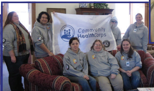
Penobscot Community Health Care members participated in MLK Day 2011 by volunteering at the Hammond Street Senior Center in Bangor, Maine