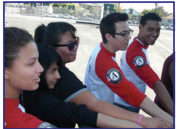
Members volunteer within their community

In addition, Community HealthCorps* VISTA Members alleviate poverty by improving the capacity of health centers to provide quality health services and programs to medically underserved people.