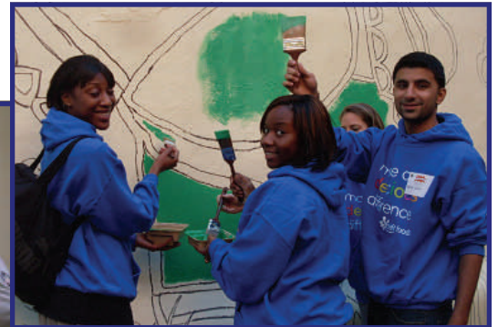
Members volunteer throughout their local communities