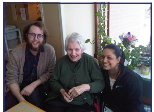
Members serve patients of all ages!