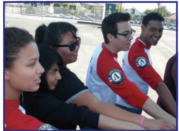
AltaMed Health Services members team up to volunteer within their community

In addition, Community HealthCorps* VISTA Members alleviate poverty by improving the capacity of health centers to provide quality health services and programs to medically underserved people.