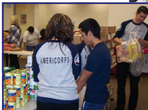
Family HealthCare Network members volunteer at a local food bank