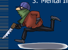
Chart the Problem!